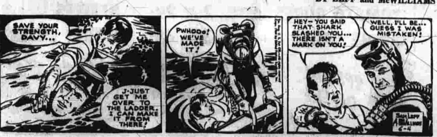
BY LEFF and McWILLIAMS